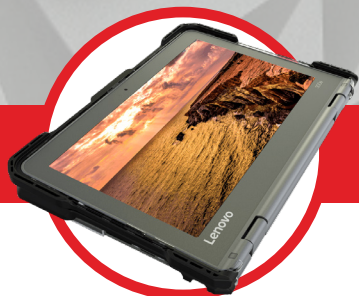
COVERED AT EVERY FOLD