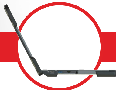
LIGHTWEIGHT YET PROTECTIVE