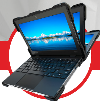
FULL RANGE OF MOTION with UZBL Clamshell case