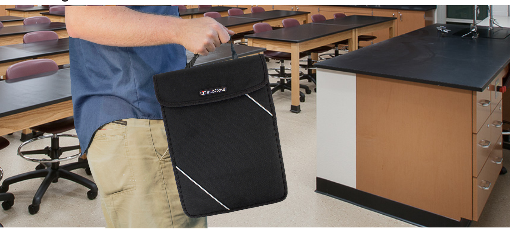
Vantage: so teachers can focus on leading, and students can focus on learning!