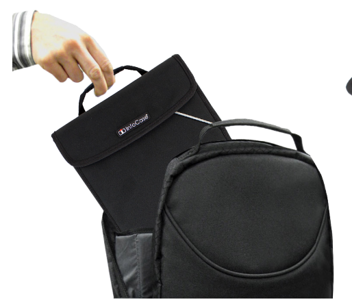
Superior Drop and Crush Protection