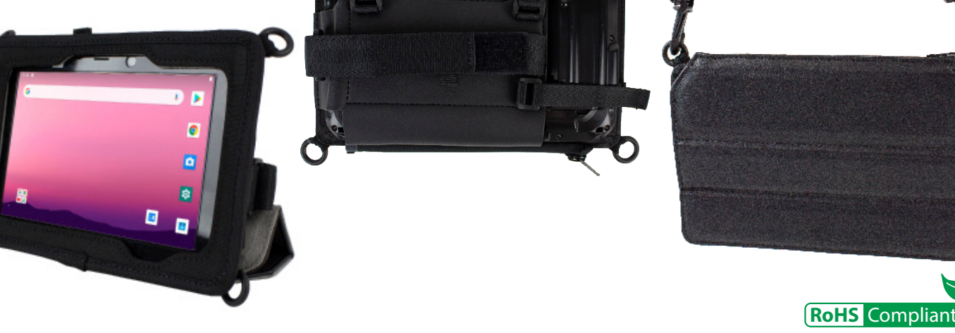
PAN NA Part#: TBD Manufacturer Part #: TBCS1AOCS-P

The ultimate in hands-free functionality. This versatile case has a removable screen cover, easel functionality, a shoulder strap, and a hand strap. It also accommodates either the portrait or landscape scanners available for the FZ-S1. All in stylish, professional, vinyl or ballistic nylon materials.