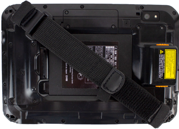
Shown in optimal orientation

Accommodates: Gamber-Johnson vehicle docks