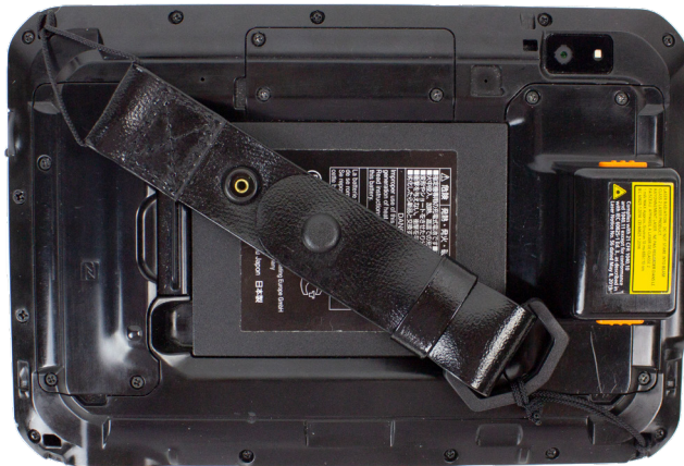
Shown in optimal orientation