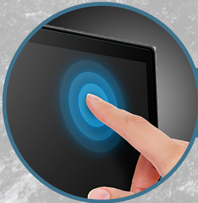
Touch and stylus compatible