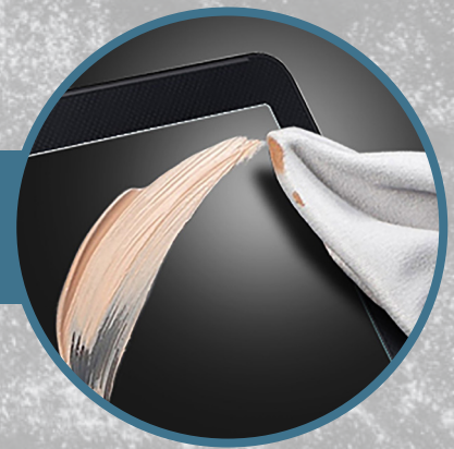
Oleophobic coating is resistant to smudge and fingerprint

We know your device screen is tough, but it is not indestructible. Avoid downtime, mitigate display replacement and extend the life of your technology investment by adding a stealth layer of display protection.