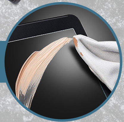
Oleophobic coating is resistant to smudge and fingerprint