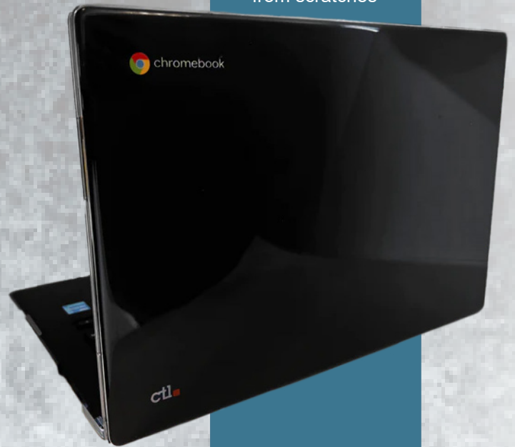
Hard plastic protects from scratches