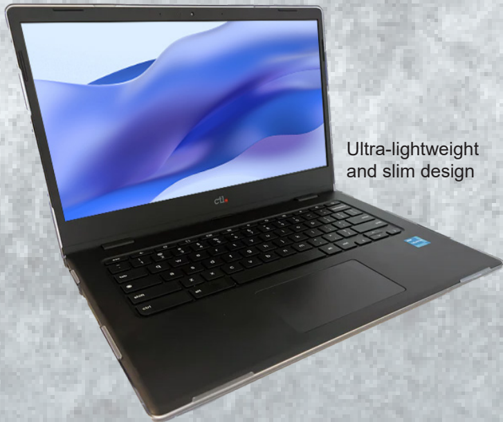
Ultra-lightweight and slim design