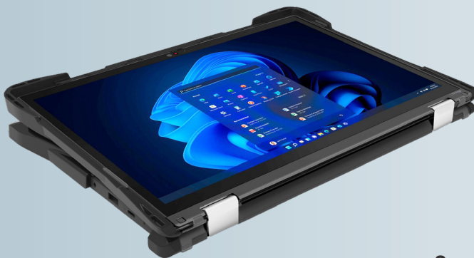
Full Range of Motion for 300/500 and Yoga series