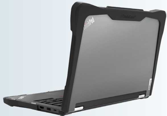
Cushioned Non-Slip Corners