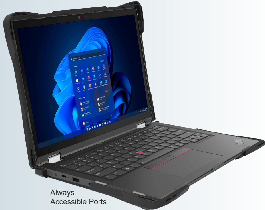
Always Accessible Ports